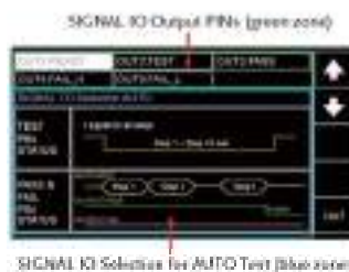
Self-defined Signal I/O

For interface connections, the GPT-10000 Series offers external control or a variety of remotely connected ports such as a signal I/O port that can be used to connect an external controller or PLC. The signal I/O's output