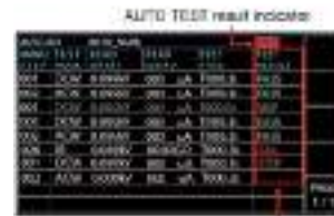
MANU STEP results indicators