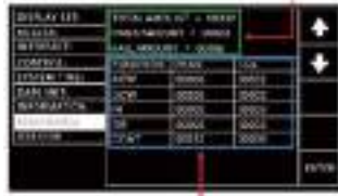
PASS & FAIL Amounts Distributions in Each Test Function