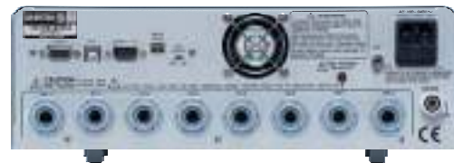
Channels Configured on the Rear Panel

The channel outputs of the GPT-9500 series are all configured on the rear panel. Other than the aesthetics of the system configuration, it is more important to effectively reduce the possibility of accidental contact by personnel. Each channel provides disconnection detection to avoid performing an invalid test.