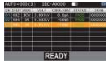
AUTO Mode Listed Result

The large-sized LCD clearly and simultaneously displays the test voltage, test parameters, test status, measurement value and judgment result. The channel usage status and statistical counting results (the total number of tests and the number of FAILs) can be