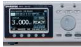
4.3' Color LCD, High-brightness Indicator and Function Keys

Operation design in simplicity is incorporated into the tester through configuring the function keys at the bottom of the LCD screen to easily change the test function by just pressing the function keys, or by rotating the knob to change the measurement value, which greatly improves the convenience of operation; updating various status indicators on the front panel immediately according to the status on the display, which not only provides users with a more comprehensive control of the test status, but also avoids unnecessary operation risks. For example, when the output is executed, the high-voltage output indicator will keep flashing.