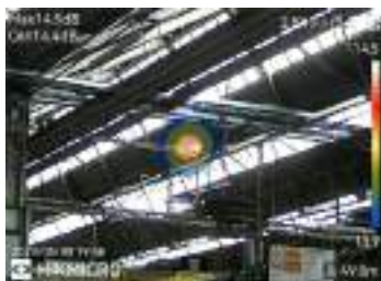
Gas Leak Detection