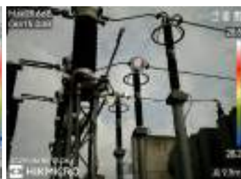
Partial Discharge Detection