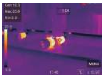
Check Machine Temperature