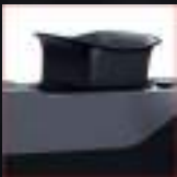
SP60, SP60H with viewfinder