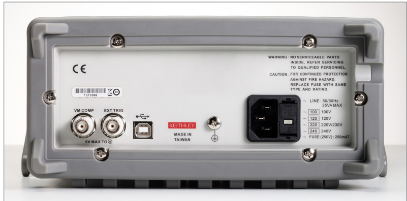
2110 rear panel.