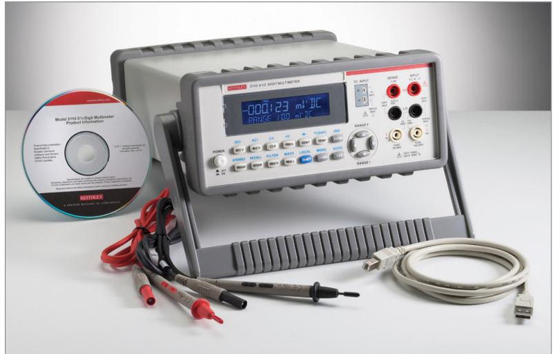
All accessories, such as start-up software, USB cable, power cable, and safety test leads, are included with the 2110.

LabView, IVI-C, and IVI-COM drivers are also supplied to allow for increased flexibility in integrating the 2110 into new and existing systems and test routines.