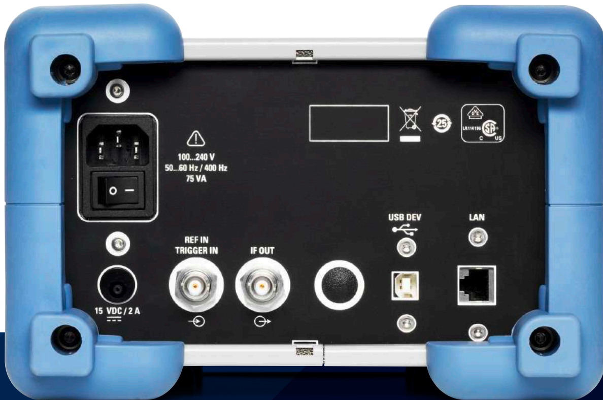
R&S®FSC rear panel

All R&S®FSC functions can be controlled via the USB and LAN interface with SCPI compatible remote control commands. LabWindows/CVI, LabView, VXIplug&play and Linux drivers are available.